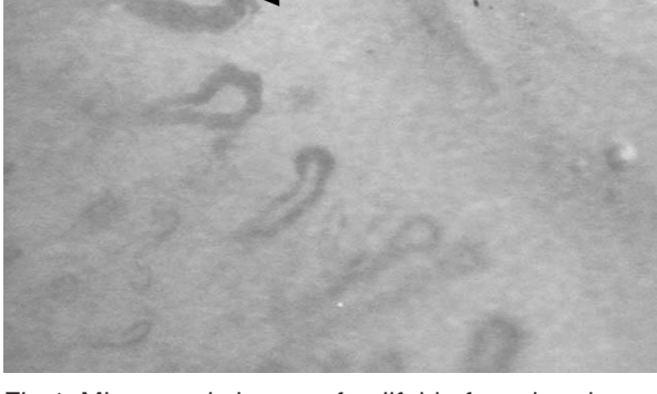
Fig.1. Microscopic image of nailfold of a scleroderma patient showing megacapillary (arrow) and irregular capillary orientation.

A decreased number of loops (<30 over 5 mm length in the distal row of the nailfold) or loss of capillaries in a field of at least 500 \mu m should be considered an avascular area. This pattern is highly characteristic of SSc. Loss of capillaries may be