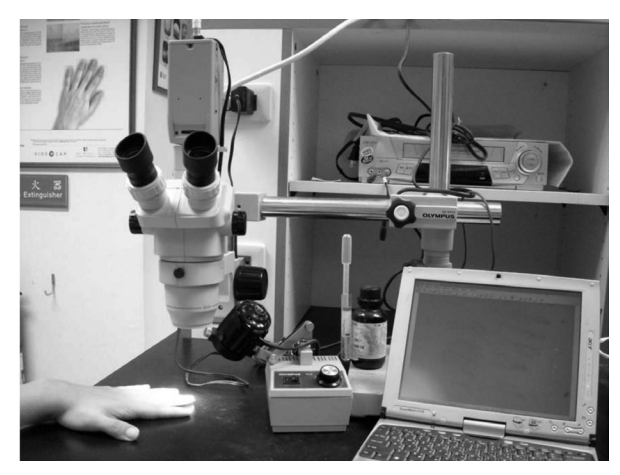
Fig.4. The present nailfold capillaroscope in authors' hospital (Olympus SZ-ZTU1).

patterns in rheumatic diseases with RP in our hospital (Table 3). We studied 97 patients, including 17 males and 80 females, who were underwent nailfold capillaroscopic examination (figure 4) during 2005-2008. Indications of NFC in these patients were RP (91), digital ulcer (4) and disease follow-up (2). Clinical diagnosis were SLE (11), RA (4), SSc (8), SS (4), MCTD (3), UCTD (17), primary RP (16), cryoglobulinemia (16), APS (2), and other diseases, including adrenal adenoma (1), palindromic rheumatism (2), peripheral arterial occlusive disease (4), cryofibrinogenemia (2), pulmonary hypertension (1), and psoriatic arthritis (1). Although, the frequencies of capillaroscopic patterns in rheumatic diseases with RP in our hospital differed from those reported in previous studies (Table 2), we suggest that further welldesigned NFC studies are required.